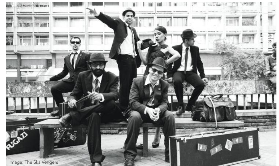
Image: The Ska Vengers

Presented with Northern Roots and VAMOS Social.