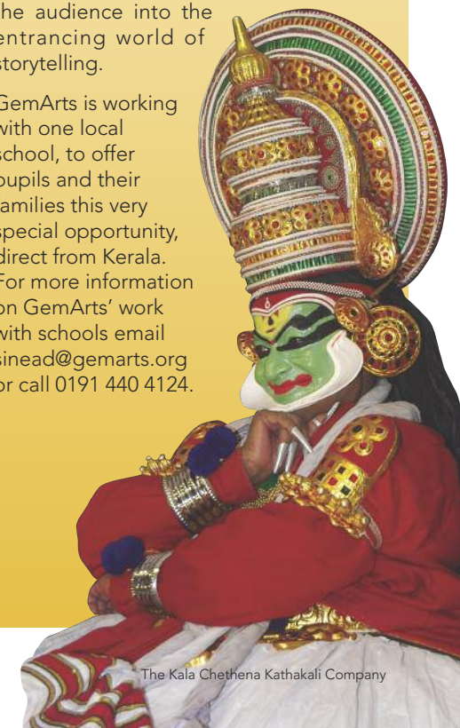
The Kala Chethena Kathakali Company

GemArts is working with one local school, to offer pupils and their families this very special opportunity, direct from Kerala. For more information on GemArts' work with schools email sinead@gemarts.org or call 0191 440 4124.